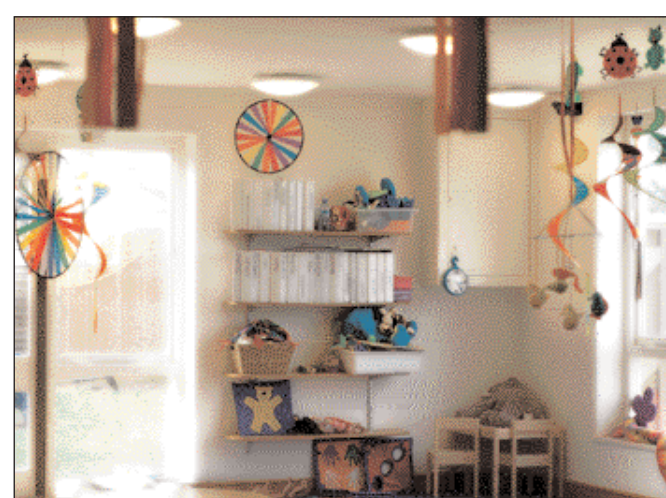
The nursery's baby play room.